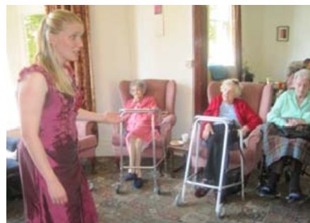
Enjoying the show

The Cats Pyjama's Productions entertained us in June with Calamity Jane which was thoroughly enjoyed by everyone. Although it was a one woman show, the story-telling was brilliant and we would love to have them back in the future.