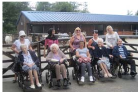
Beautiful weather, lovely food and good company made for a great day out

On the 24th July we went to the Elizabeth Svendens Donkey Sanctuary in Manchester where we had a lovely lunch provided by the staff and were also able to watch part of the riding lessons for the children. Everyone had a lovely day and the weather was beautiful.