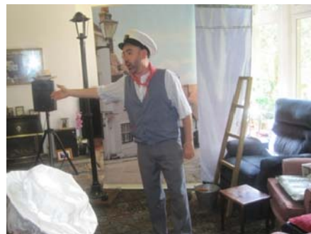
Light Entertainment from Northeast Producers

They recently visited us with their variety show "When I'm Cleaning Windows". The show was very funny and extremely interactive with lots of laughs and a great sing along.