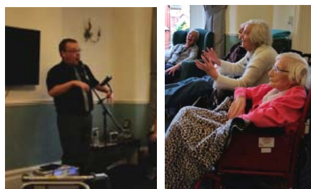
Everyone enjoyed a Disney moment!

On Friday, 31st October we all enjoyed a very special visit from the Vintage Scene Academy who thoroughly entertained us with their Disney Show