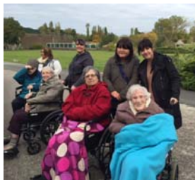
Fun at the zoo