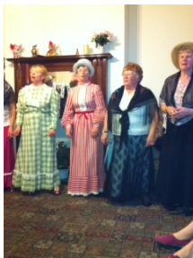
The Victorian Singers

On the 18th April everyone took part in an evening of Victorian entertainment.